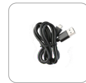
Data cable PC143