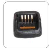
MUC Rapid-rate Charger