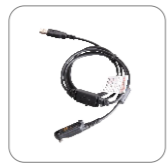
Programming cable PC155