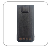
Battery 2000mAh BL2021