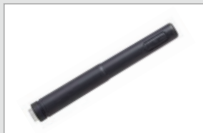
Standard antenna (UHF or VHF)