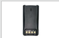
BL2008 - Lithium-Ion Battery (2000mAh)