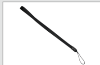
RO04 - Leather Wrist Strap