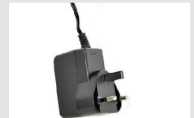
Power supply unit for charger (PS1044)