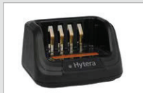
CH10A07 - MCU Rapid-Rate Charger