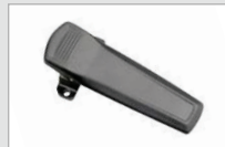
BC19 - Belt Clip