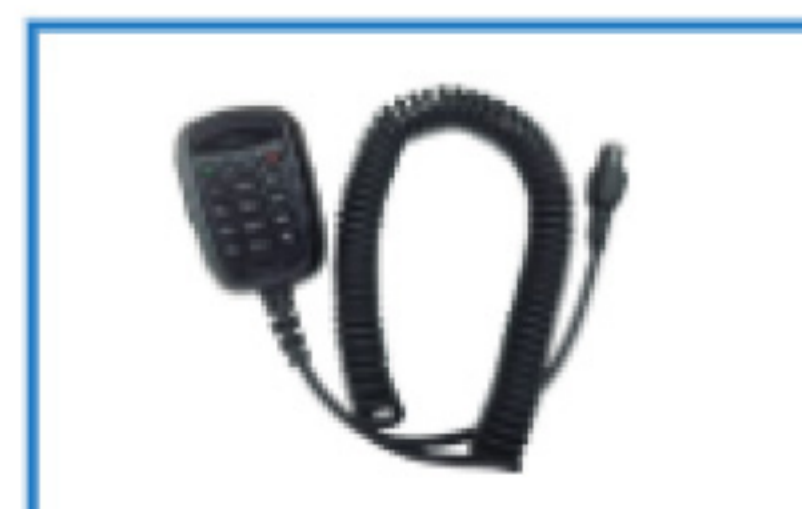
Hand Microphone (with keypad)